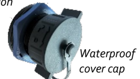
Waterproof cover cap