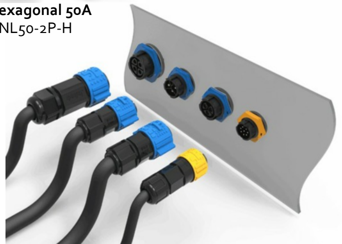
Hexagonal plate version - 10-50A (2-11 pin versions)