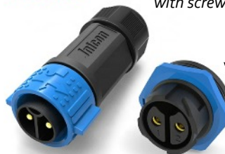
No screws, just 27-28mm diameter hole