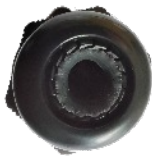
Durable rubber sleeve moulds to the shape of the cable/s

Simply align arrows, push in and the ring locks automatically, turn the locking ring anti-clockwise to remove the plug. Will be available in elongated plate version with waterproof flip cover and hexagonal plate with twist on/off cover. Great for electric reels, electric trolling motors, DC powered fridges, audio and other DC powered appliances not exceeding 50A current draw.